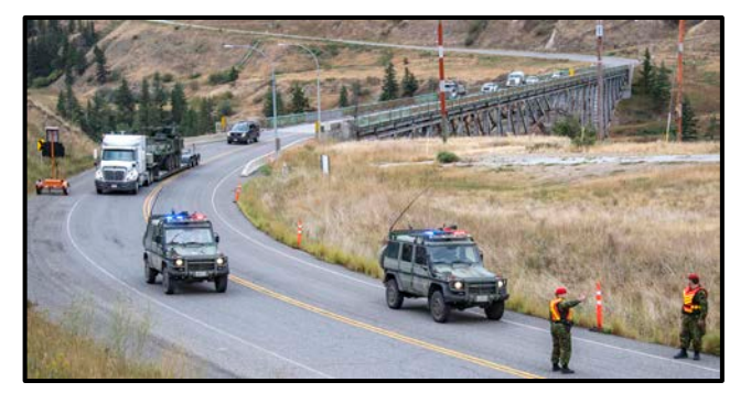
Cpl Valerie Cornfield of 12 MP Flt Comox and Cpl Clayton Bennett of 1 MP Pl Edmonton conduct traffic control in the Fraser River Valley to allow full access for the flatbed.