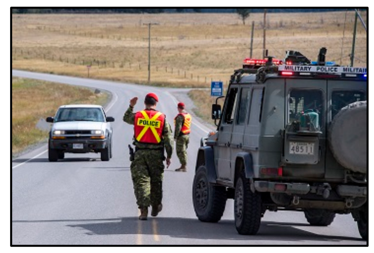
MP provide escort to a flatbed truck up an incline and around a hairpin turn in the Fraser River Valley, on the road from the Riske Creek camp to the Williams Lake camp, during Operation LENTUS 17-04 in British Columbia on September 9, 2017. Here, Sgt Jason Moldovan and Cpl Drewe De Boer of 1 MP PI Edmonton conduct traffic control at Riske Creek BC.

At the height of this mission, the CAF employed approximately 800 troops in the province, including members of 1 Military Police Regiment, Military Police Unit Esquimalt and 12 Military Police Flight Comox. In total, more than 2 000 troops from across Canada provided support to the Province over the course of the operation.