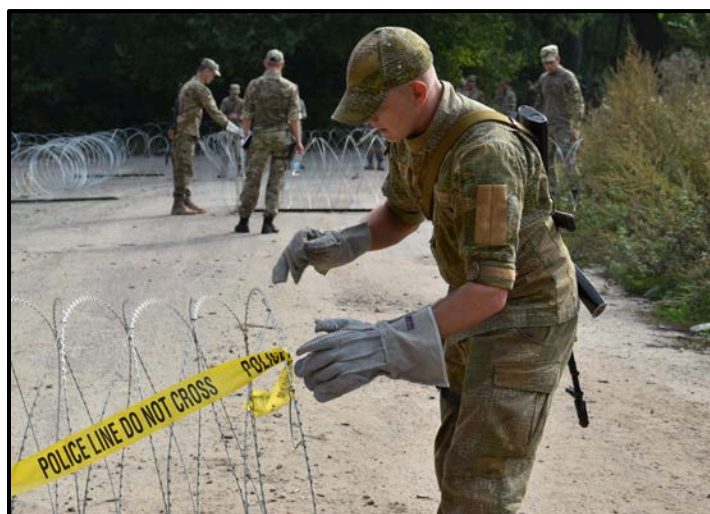
Ukrainian Military Law and Order Service trainees prepare a vehicle checkpoint following a lesson by Canadian instructors during Operation UNIFIER in Ukraine.

One of the biggest challenges we have is language. It's the Cyrillic alphabet, Ukrainian language, and of course Ukrainian and Russian are spoken interchangeably. I was able to get the services of a Ukrainian speaker and writer as well as a Russian speaker and writer to assist with translation of our curriculum.