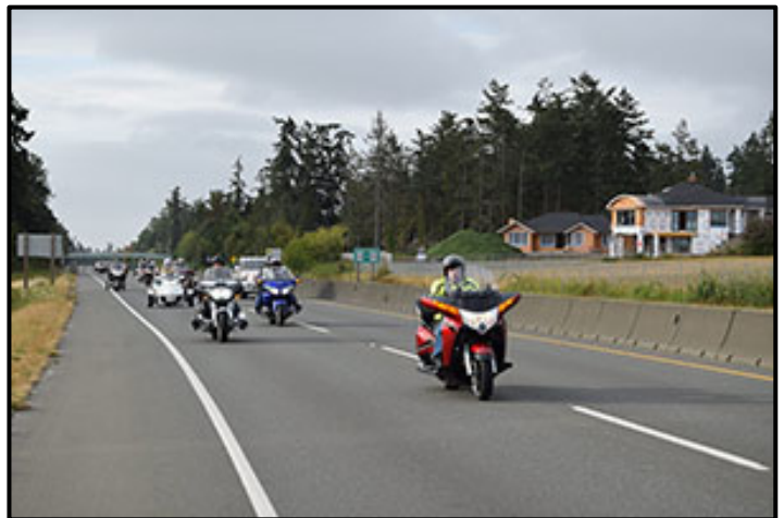
Participants in the 2016 Military Police National Motorcycle Relay roar down a Canadian highway on route raising $60 000 for blind children.